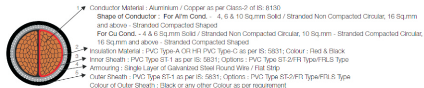
ARMoured CABLES Cross-sectional view